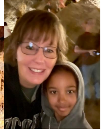
CBC Middle and High School Students at Crystal Cave May 21, 2023.